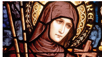
Feast Day: May 16