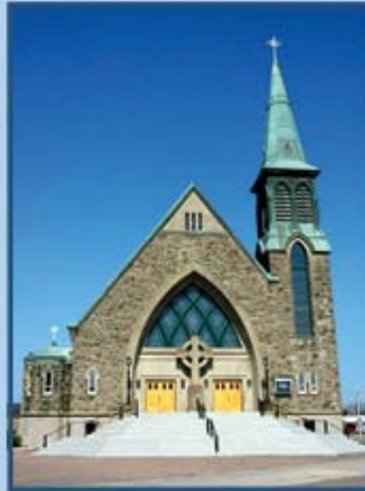
Saint Augustine's Moncton