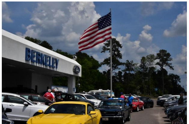
2 nd Stop – Berkeley Ford (The Cruise)