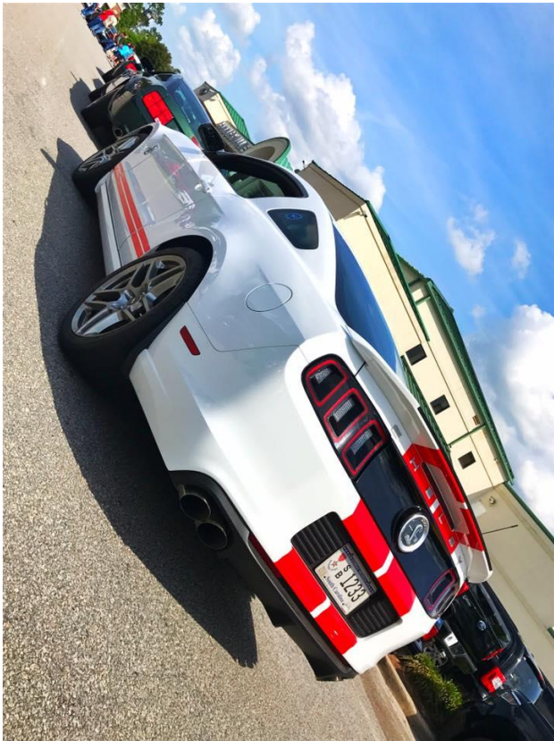
Sweet shot of Bill's GT500! (Summerville Ford)