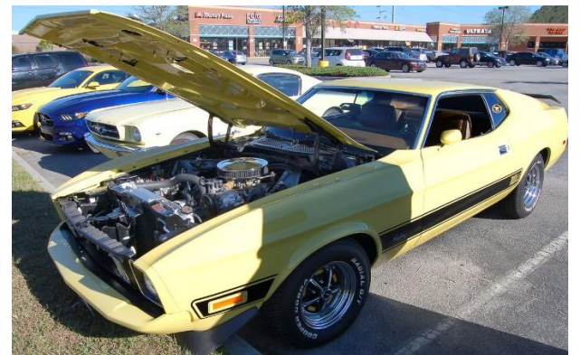
Cameron Brady's Mach 1 (Sonic)