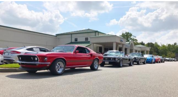
Summerville Ford (The Cruise)