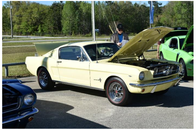
Larry Hawkin's 1965 2+2 (Ravenel)