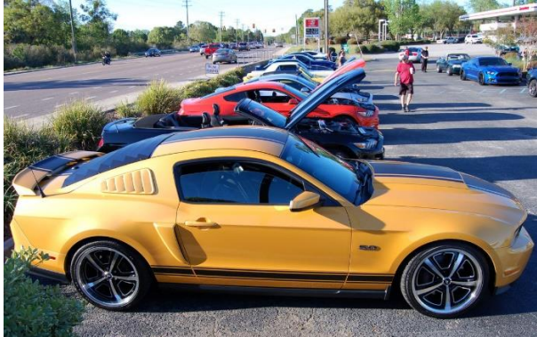
Jim Dinning's Yellow Blaze @ Sonic