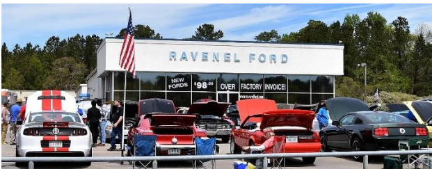
Let me guess