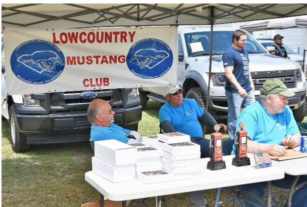
Fine looking crew! (Ravenel)