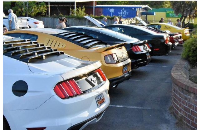
Mustangs! (Pizza Night)