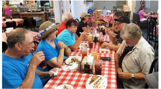
Lunch @ Music Man BBQ! (End of the Cruise)