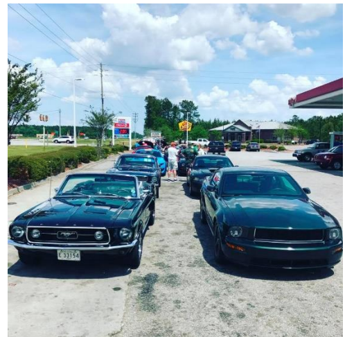
Gathering Point! (The Cruise)