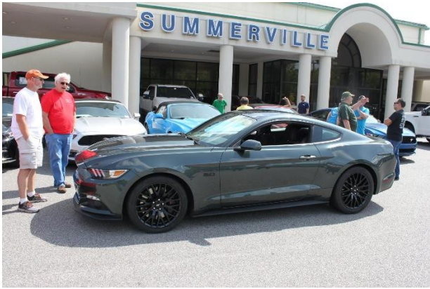
668 HP on the ground! Kyle Hunt's bad boy on the Cruise!