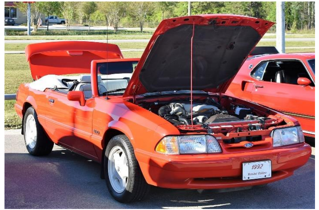
Cathy's Fox! (Ravenel)