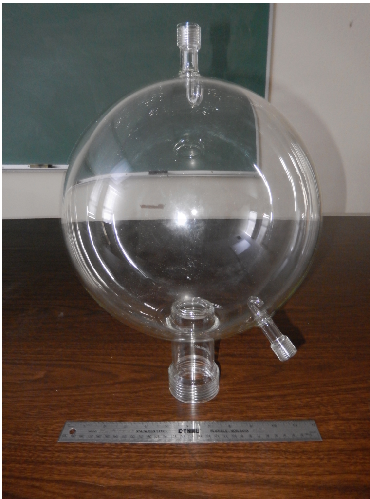
A 12 liter preliminary prototype envelope borosilicate glass sphere. Please keep confidential within your organization only.

The initial experiment will be a phase I reactor assembly approximately 0.6 x 0.6 meters and 0.9 meters high. The reactor is a borosilicate glass sphere of 12 liters volume and has a 20 mm interior target. It is surrounded by high voltage ceramics and an outer aluminum housing. Maximum design power is 2400 watts with a target temperature of about 870 °C. At 2400 watts, it projected to put out about 2.4 \times 10^{15} neutrons per second of about 2.45 MeV energy.