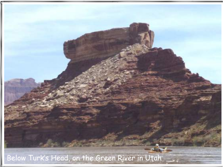
Below Turk's Head, on the Green River in Utah