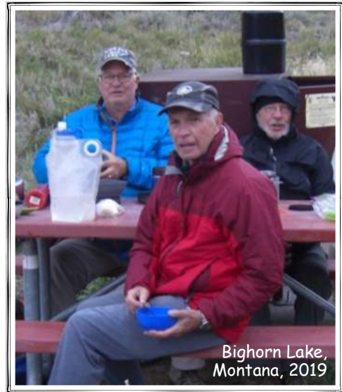
Bighorn Lake, Montana, 2019