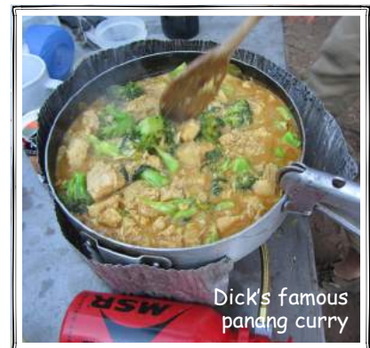
Dick's famous pandang curry