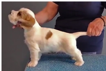
Noel's Dior Baccarat Rouge/Blaise