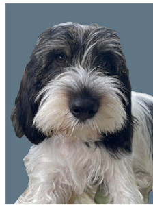
Noel's Dior Sauvage/Regis