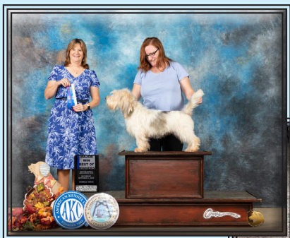
Fodnote Icebreaker, PCJH "Lego"