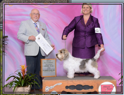
GCH CH Always Belle of Ellis Island, PCJHX, PCSHX