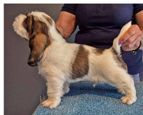
Noel's Versace of Dior/Sachi