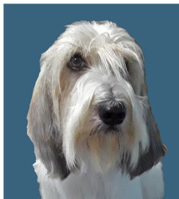
Noel's French Connection/Clouseau