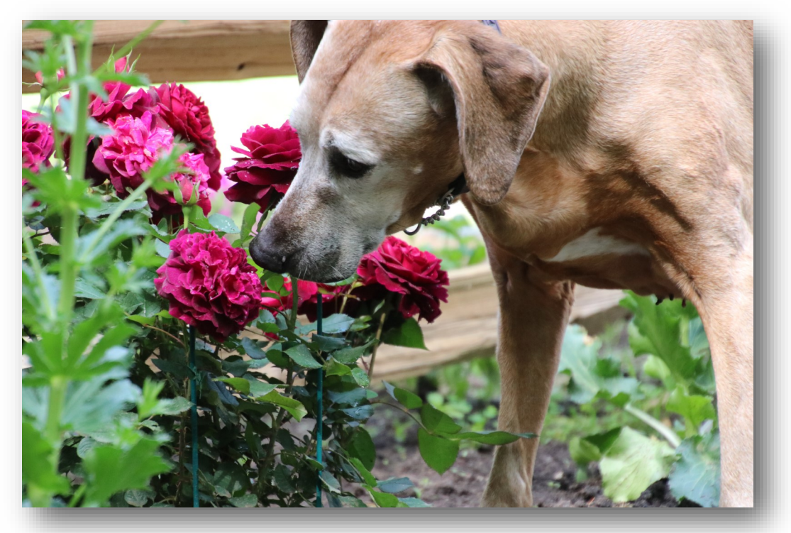
"You're only here for a short visit. Don't hurry. Don't worry. And be sure to smell the flowers along the way." — Walter Hagen