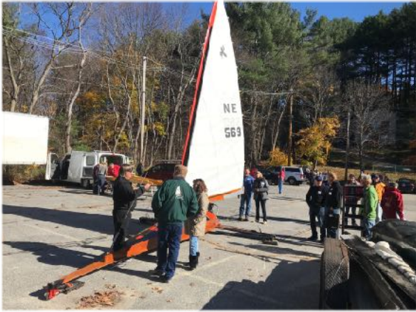
Club Salesmen, one at the bow, one at the stern. HicDic SOLD