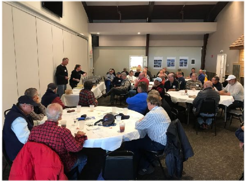
Annual NEIYA Meeting