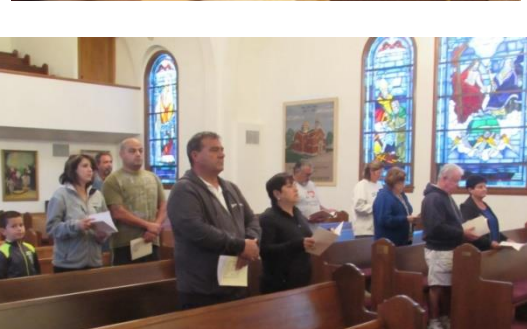
• Fellowship at night and in the morning

Rise early and worship together at sunrise