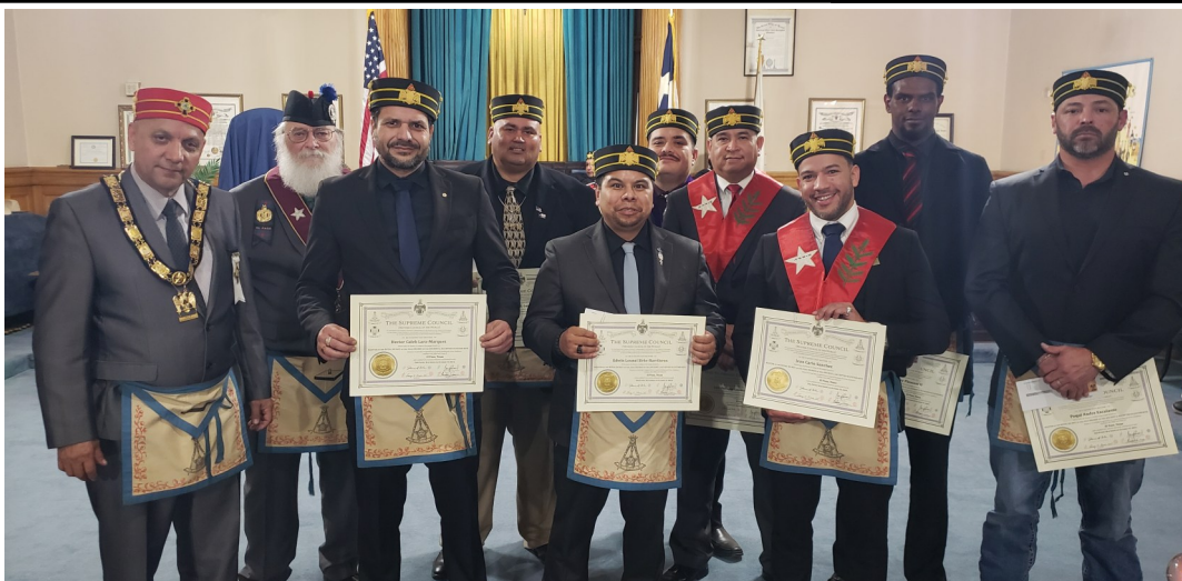
Patent presentation to part of our new members of the 2024 Fall Reunion, during the December Stated Meeting