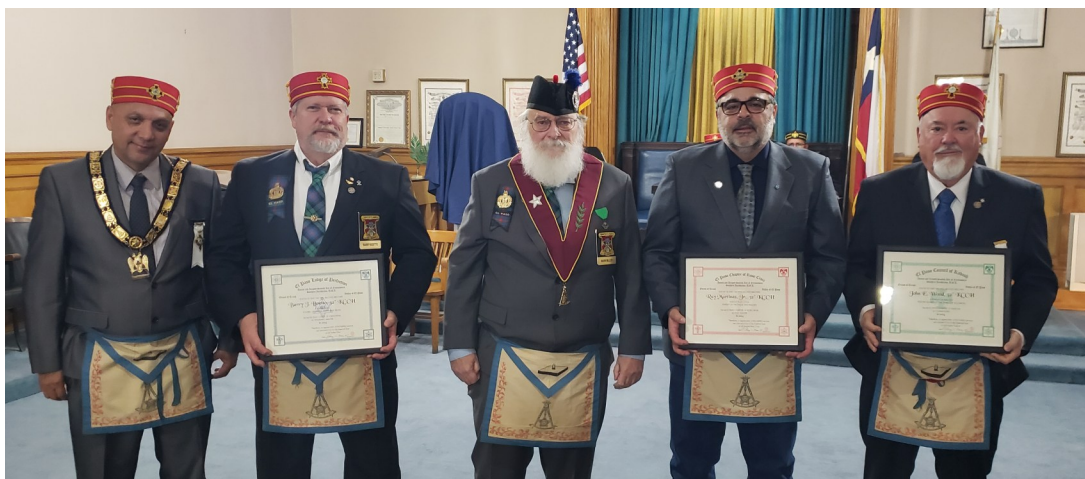
Presentation of Certificates to our outgoing 2024 Officers