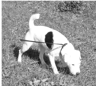
Cairnbrae Spider "Spider" is owned by Sue Godbehere