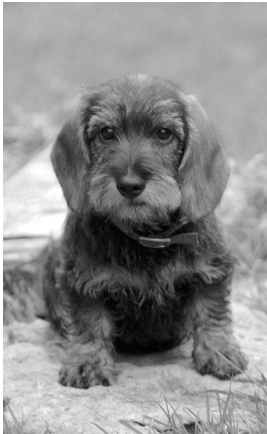
Victory's Bean With The Devil "Dexter" is owned by Eileen Fisher.