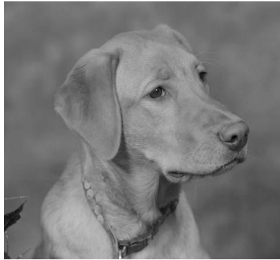
Treasurehunt's Touch N Go "Terra" is owned by Peggy Masanotti