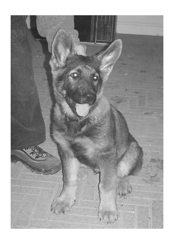
Kieran vom Eichenluft "Kieran" is owned by Bev Wiggans