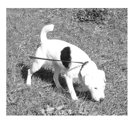
Cairnbrae Spider "Spider" is owned by Sue Godbehere