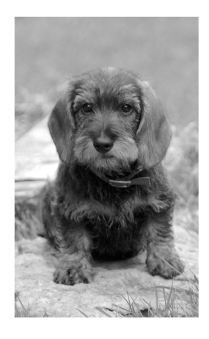
Victory's Bean With The Devil "Dexter" is owned by Eileen Fisher.