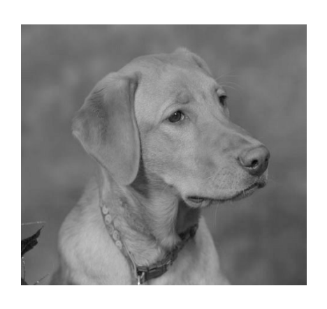
Treasurehunt's Touch N Go "Terra" is owned by Peggy Masanotti