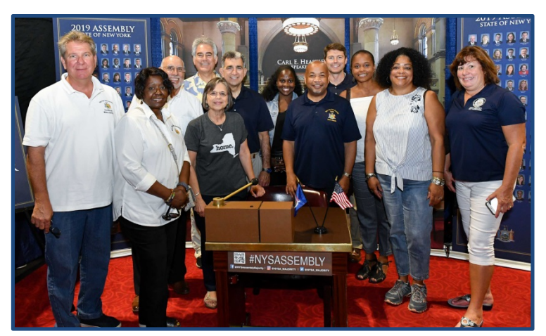
Assembly members at the Assembly's booth in the Center of Progress Building during their tour of the New York State Fair.