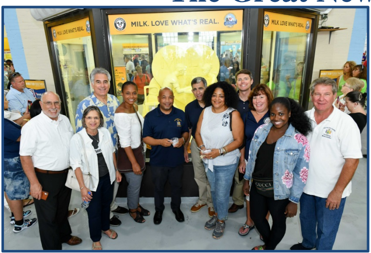
Speaker of the Assembly Carl Heastie and other members of the Assembly took a tour of the Fair and enjoyed viewing this year's butter sculpture.