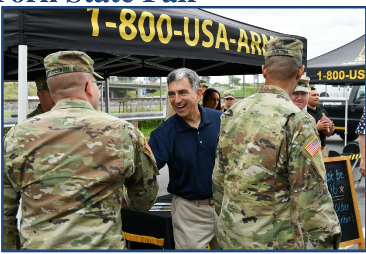
Assemblyman Magnarelli greets soldiers at the Army tent.