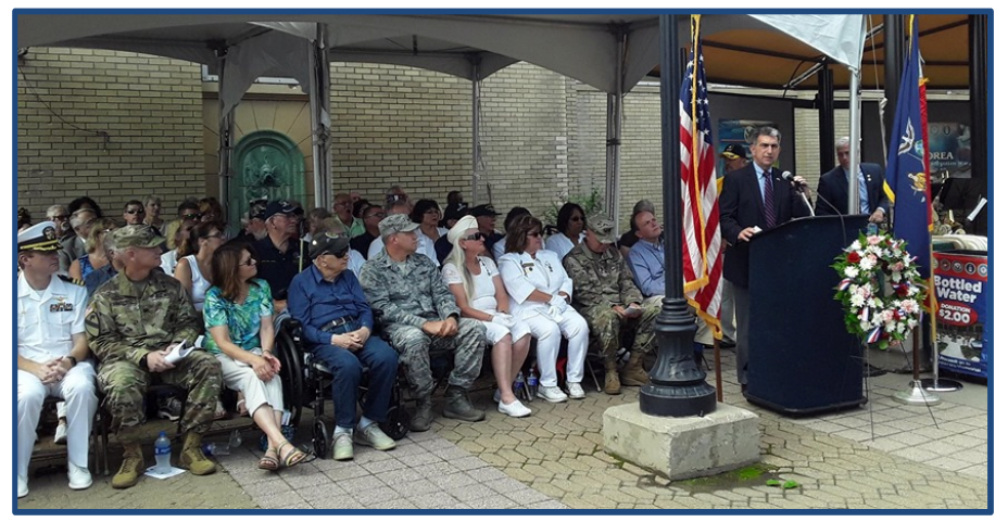
Assemblyman Magnarelli spoke at the Armed Forces Day at the NYS Fair honoring the men and women who serve or have served our country in uniform.