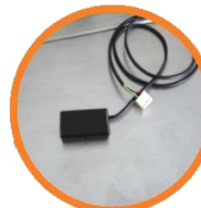
Infrared Temp Control