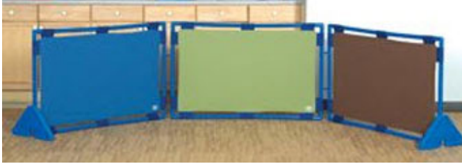
Childrens Factory CF900-922 Cozy Woodland set of 3 Rectangle Play Panels (PlayPanels)

http://www.creativityinstitute.com/Childrens-Factory-CF900-922-Cozy-Woodland-set-of-3-Rectangle-Play-Panels.aspx