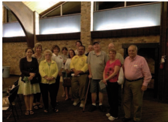
Gift card drawing winners!