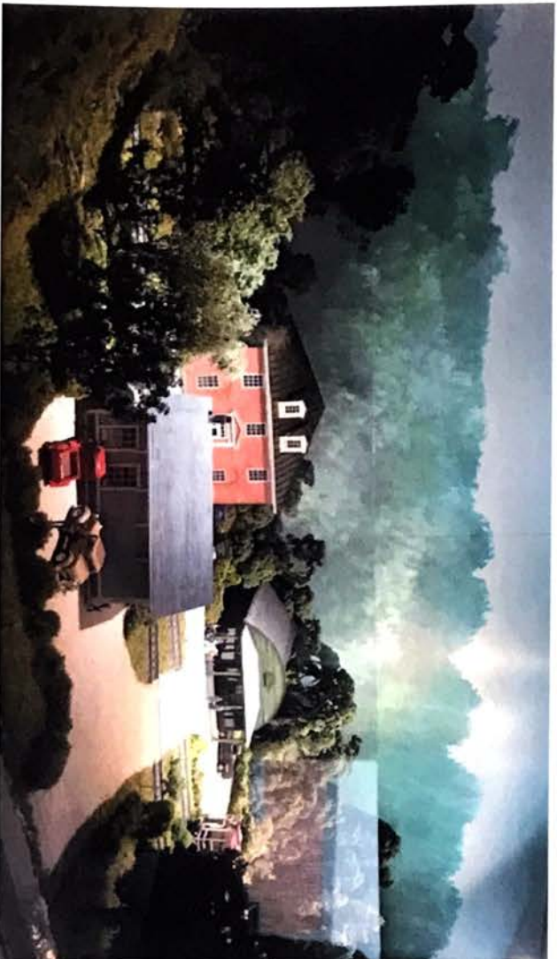
Post Office, Steed's Store, Depot