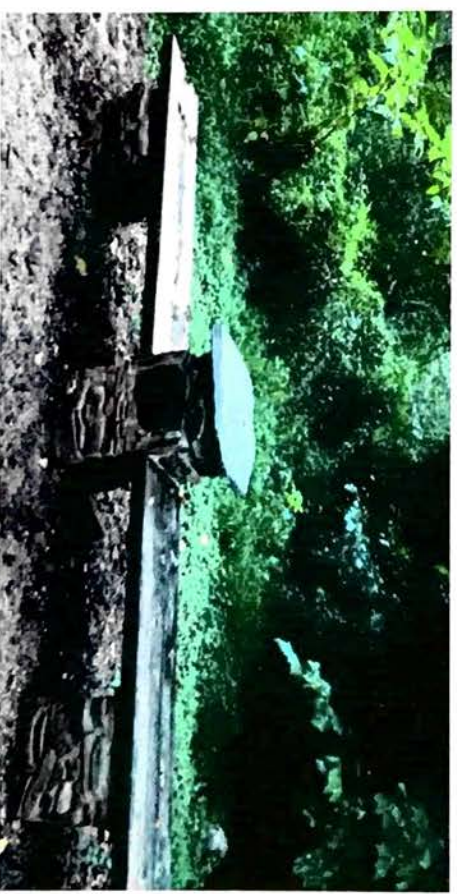
Bench built by Eagle Scouts