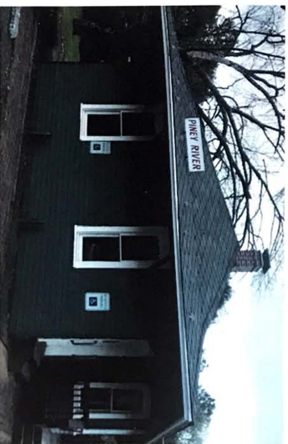
Piney River Depot