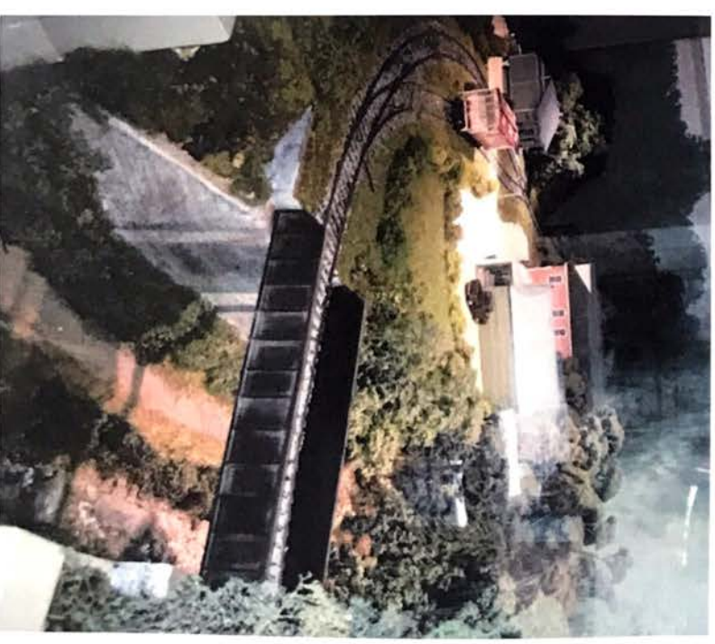
Trail Trestle over Esmont Road