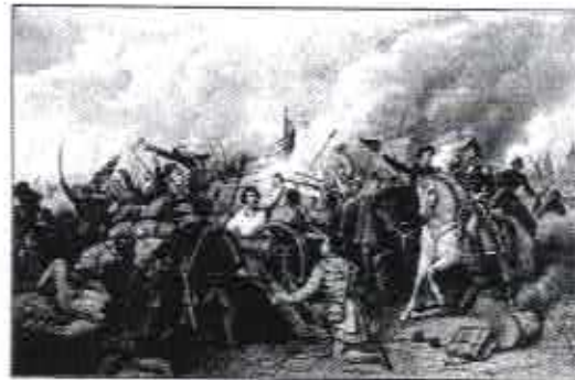
Battle of New Orleans