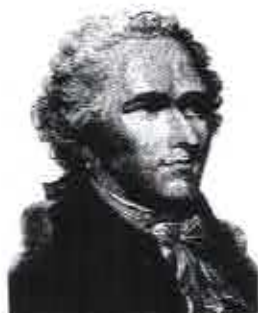
Alexander Hamilton Federalist