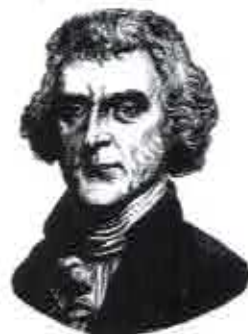
Thomas Jefferson Democratic-Republican