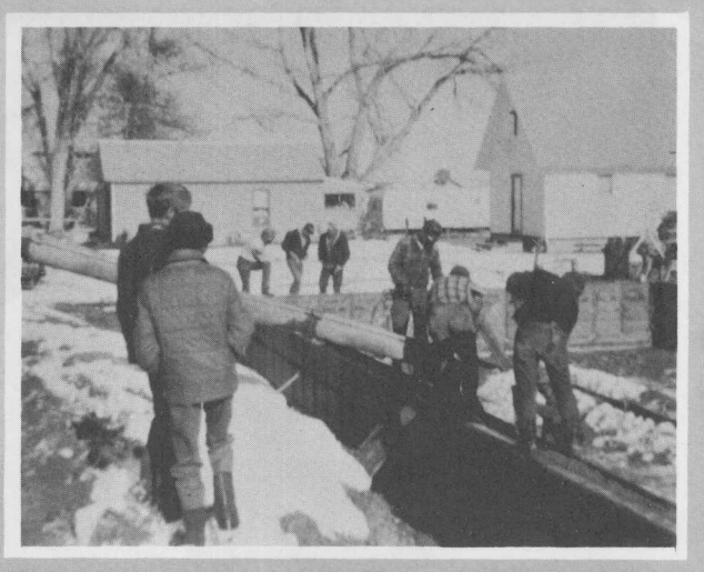
Working on new church in Hudson, Wyoming

THE APOSTOLIC FAITH REPORT P. O. Box 658 Baxter Springs, Kansas 66713 Address Correction Requested