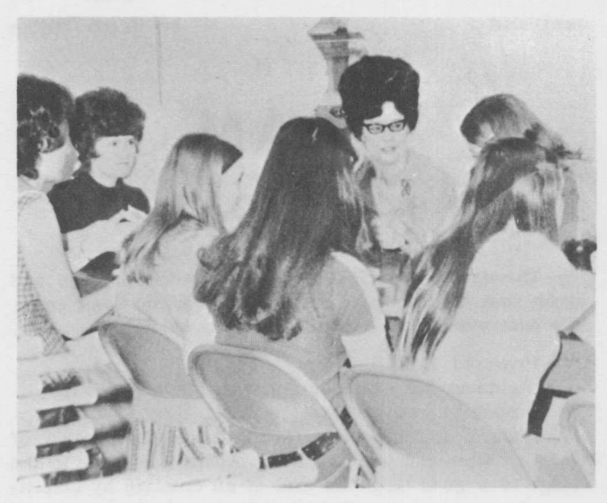
faculty and students at lunch