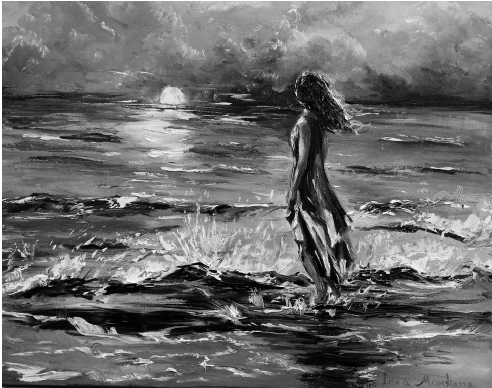
Woman by the Sea by Inna Montano 2016