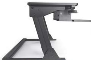
Side view - high