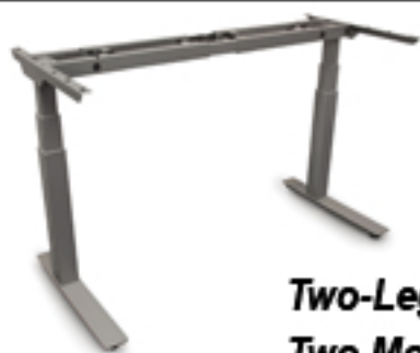
Two-Leg, Two Motor