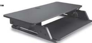
Side view - low