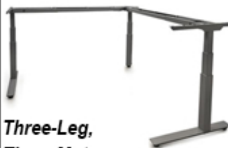
Three-Leg, Three Motor