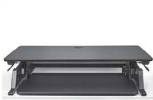
Front view - low