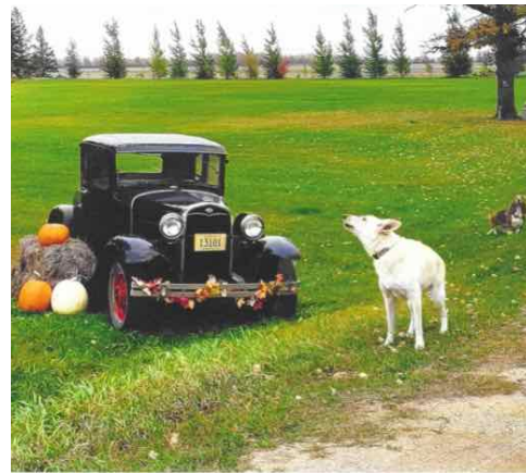
Winner General Category