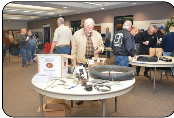
Our silent swap auction table