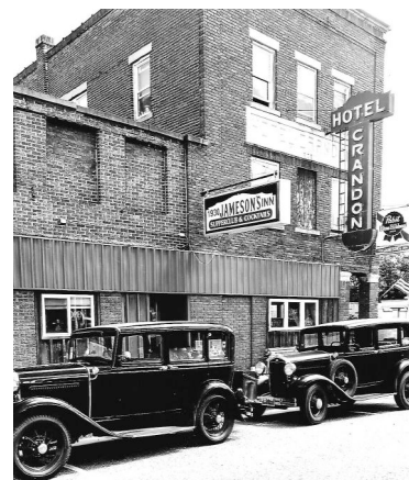
Winner General Category