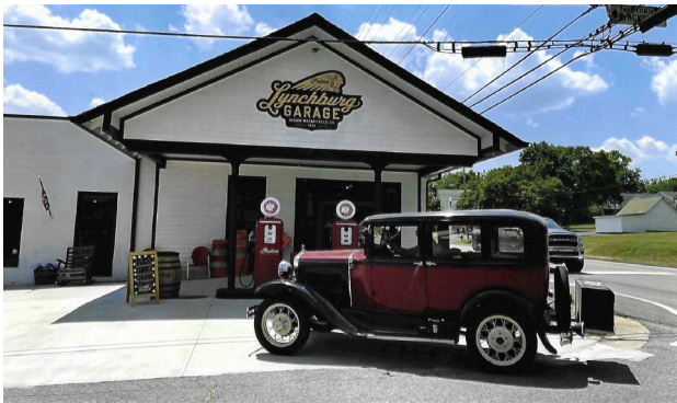
Winner General Category