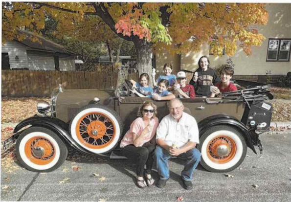
Winner Special Category Ice Cream