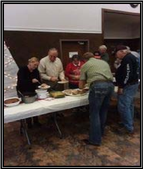
Chapter LA-J had fun and fellowship at our 2018 Christmas Social. There was tasty food and everyone enjoyed the festivities, especially the White Elephant game.