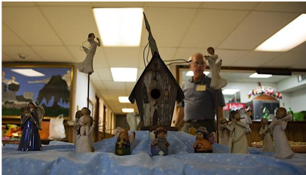
Beautiful Refreshment Table Decorations