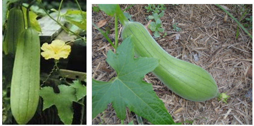
Edible Loofah gourd or Luffa Squash