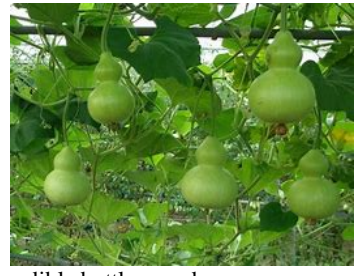
edible bottle gourd