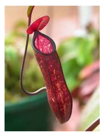
This pitcher plant head shapes like some Ban or man cocky or penis with a cover

The pitcher plant protects the lips, brain, the hair, the scalp, and the head. It protects the pussy/vagina, the cocky/penis, the Burn/sperm, the fallopian tube, the whomb/womb, the batty/Anus. Look at the shape of the pitcher plants above, they look like a pussy, they look like a cocky, and also looks like a sperm. They also have hairs on the veins. The pitcher plant is also good to protect the Cocky or penis head. The juice from the Pitcher plant is to be used estremely weak to rub on the Cocky/penis to protect it from the devel. The weak silicone from it can be used to put in the man briefs to protect the penis area and the batty area. The pitcher plant can also be used as the Ban or man Pussy Cover. Some are better man pussy cover than others. The plants shaping like a penis is the best ones for the Ban or man gender.