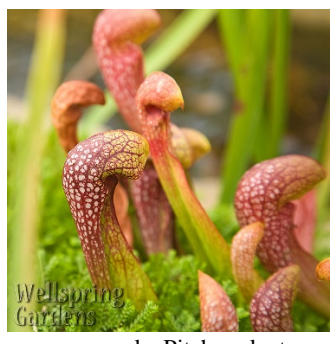
snake Pitcher plant

The pitcher plant a few pages below that has frilly top and looks like the red Croton plant, is used to kill croaking lizzards, crocostalians/crocodiles, and toads in high strength. Not all pitcher plants can kill the croaking insects or animals only the ones that looks like them. It is also used to protect the brain and it looks similar to the mushy brain.