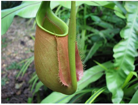
pitcher plants that looks like pussy, cocky. Good for hair, lip, fallopian tube, veins, pussy, cocky, schrotum/scrotum

The pitcher plant protects the lips, brain, the hair, the scalp, and the head. It protects the pussy/vagina, the cocky/penis, the Burn/sperm, the fallopian tube, the whomb/womb, the batty/Anus. Look at the shape of the pitcher plants above, they look like a pussy, they look like a cocky, and also looks like a sperm. They also have hairs on the veins. The pitcher plant is also good to protect the Cocky or penis head. The juice from the Pitcher plant is to be used estremely weak to rub on the Cocky/penis to protect it from the devel. The weak silicone from it can be used to put in the man briefs to protect the penis area and the batty area. The pitcher plant can also be used as the Ban or man Pussy Cover. Some are better man pussy cover than others. The plants shaping like a penis is the best ones for the Ban or man gender.