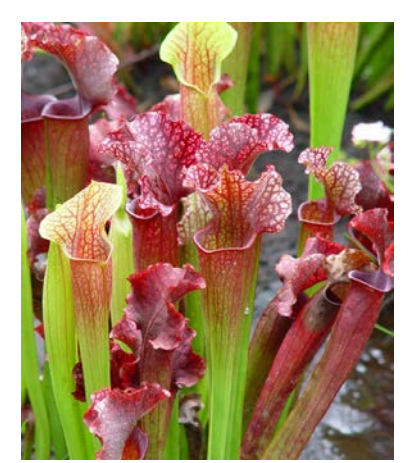
This pitcher plant can be used to make clothes, to protect the pussy, the brain, the lips and kill croaking insects 11 - 5