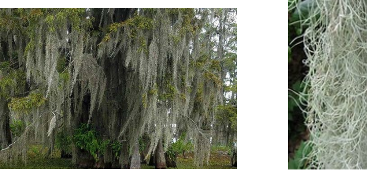
Knix Knox or Spanish Moss on Oak tree – Fry the green ones just picked from the tree in Olive oil without washing it. Use it in the hair, and on the skin and drink a mouthful of the oil daily if possible. Boil it and put all over the body.

The Knix Knox Plant is also to be used as a sieve or a strainer to attach to the silicone tube or silicone head to sieve and remove the devels from the water being used inside the woman's pussy or spewed on the woman's pussy. The knix knox strainer is to be attached to the head of the silicone and to be replaced often and will be effective to remove the devels. The Knix Knox sieve must be protected with the white rice water or white rice milk and then use the ucalyptus oil to seal it and protect it. The rice seeds or rice grains should be rubbed together to loosen the protection on the rice and then fried in olive oil or olivia oil to make the rice oil protection. You can also use a mixture of the white rice water and the ucalyptus juice to protect the knix knox sieve. You can also use the oil from the egg white fried in Olive Oil and other silicone plant to protect the knix knox strainer/sieve.