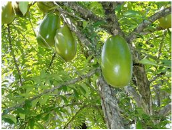
Calabash - oil and juice good for breast

The oils from these gourd is good for the hair, the breast and the body. As you can see the shapes are similar to the breast. Some of the long ones are escellent for men and for the Cocky protection.