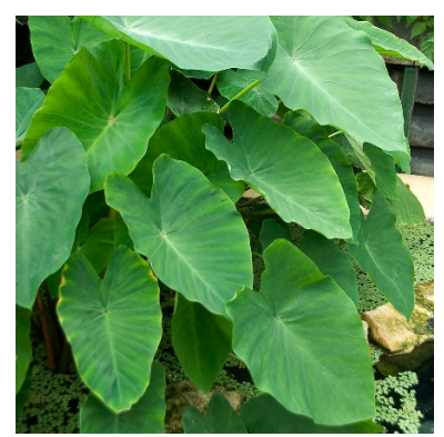
The Christ Plant or Alocasia plant