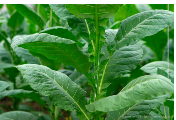
Cuban Tobacco leaves which is a Lettis or Lettuce

All Lettuce vegetable plants are to be spelt Lett Is/Lettis which means Paulett Is. Dandelion plants are also Lettis/Lettuce and can be eaten with salad dressing or with vinegarette dressing. Dandelion plant is escellent to protect against and to cure all cancers. Cuban tobacco Lettis/lettuce can be eaten when they are not overgrown and add salad dressing on them or vinegarette.