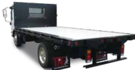
Composite Platform Bodies