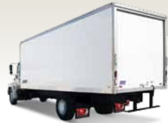
Dry Freight Van Bodies