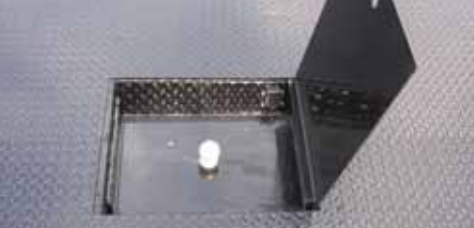
Ball hitch access door