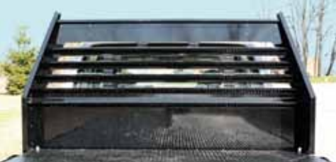
Slotted bulkhead for visibility