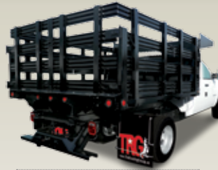
Steel Stake and Platform Bodies