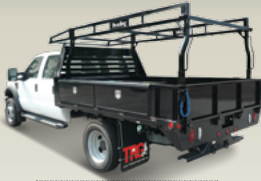
Steel Contractor Bodies