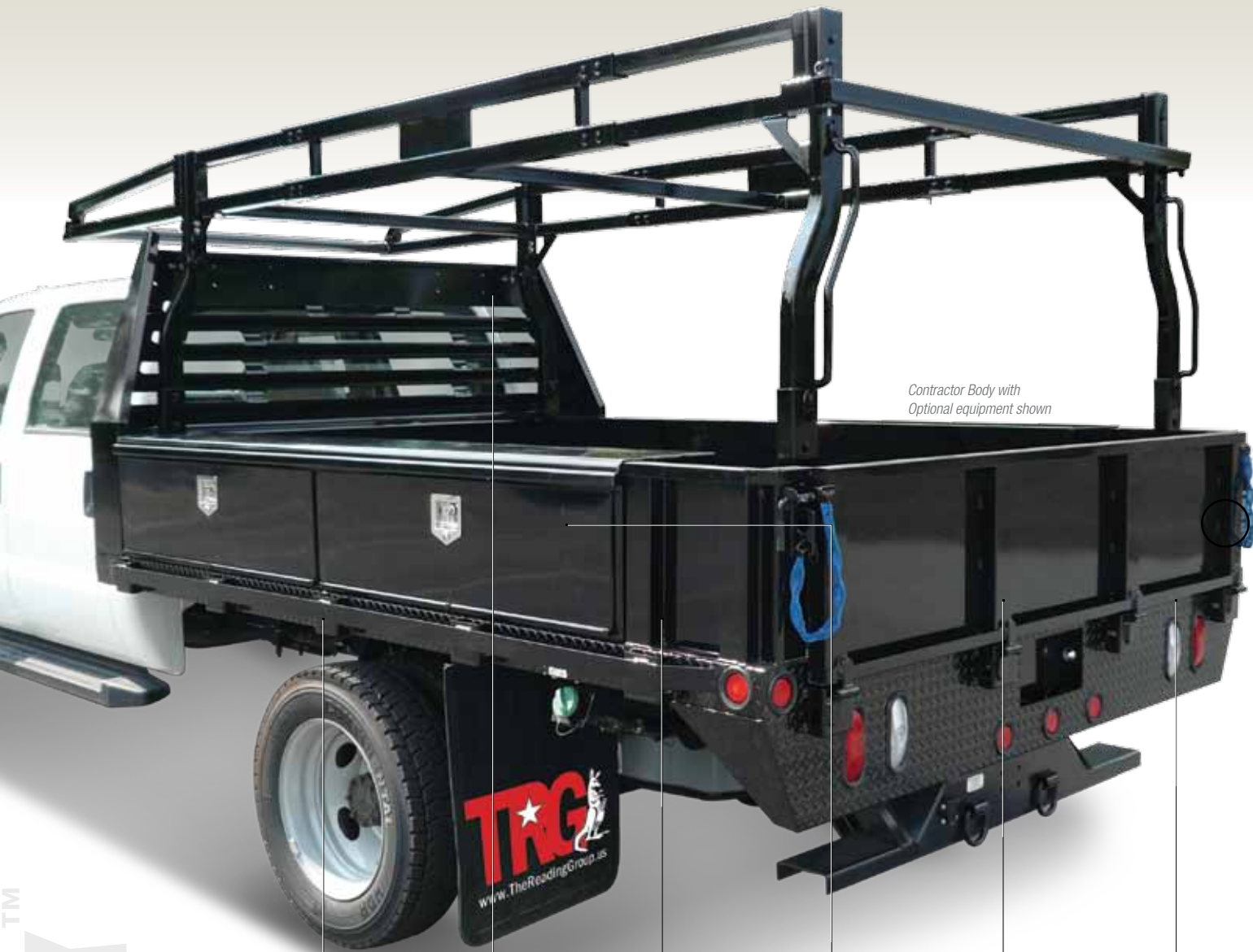
Contractor Body with Optional equipment shown