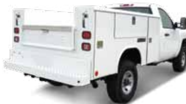
Aluminum Service Bodies