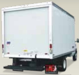
Cut-Away Van Bodies

The Reading Group has a full line of trucks built for the long haul.