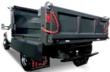
Drop Side Dump Bodies