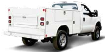
Steel Service Bodies