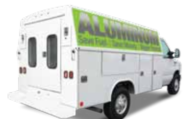
Service Vans 57" and 75" single and dual wheel