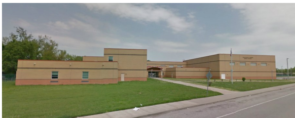
Wyvetter Younge Middle School