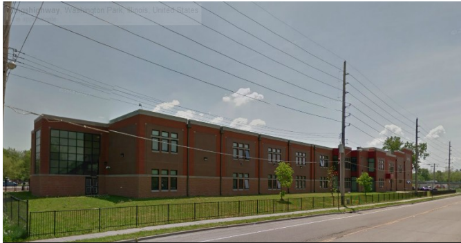
James Avant Elementary School

Washington Park is primarily a community of young families and singles.