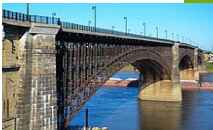
Eads Bridge connects Washington Park to metro St. Louis