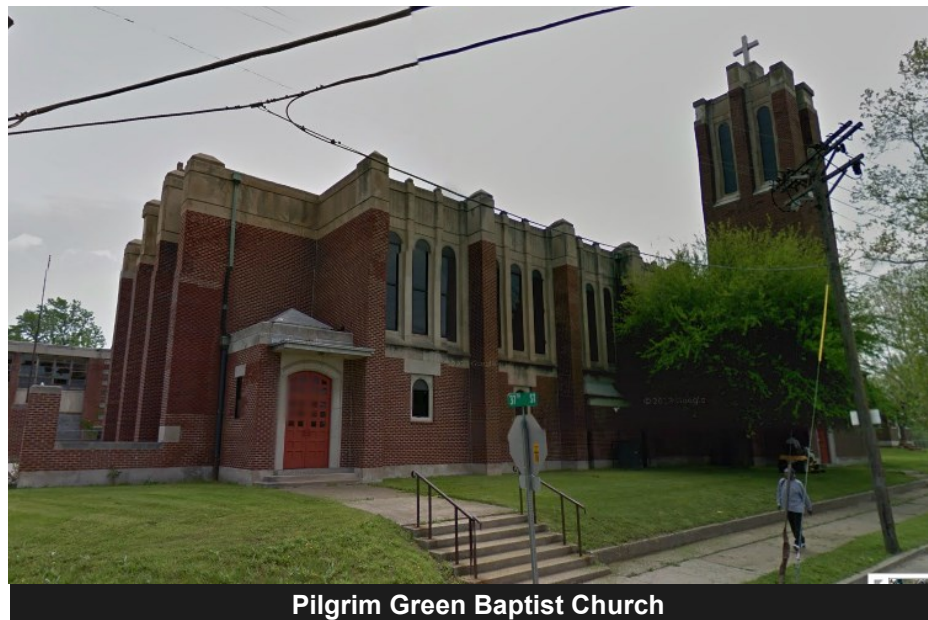
Pilgrim Green Baptist Church

Trinity United Methodist Church 5110 Forest Blvd. Washington Park, II 62204 618-482-4246