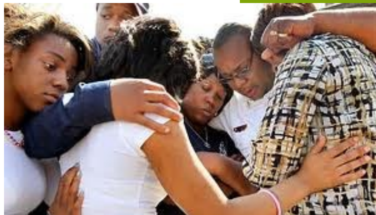
Washington Park, Illinois, residents mourn the murder of their mayor.

It is located in the East St. Louis school district, but has its own grade school and a nearby middle school.