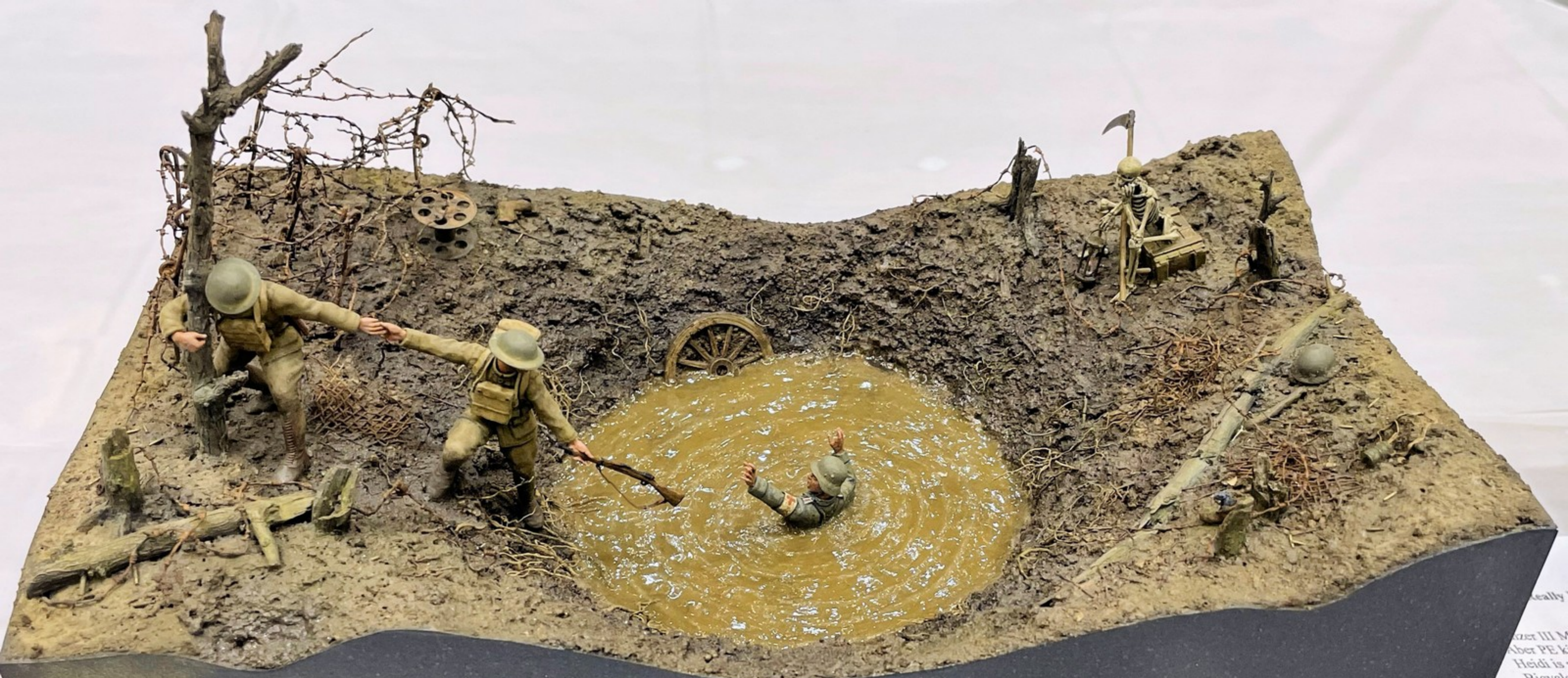
While Death Patiently Looks On An Act of Mercy