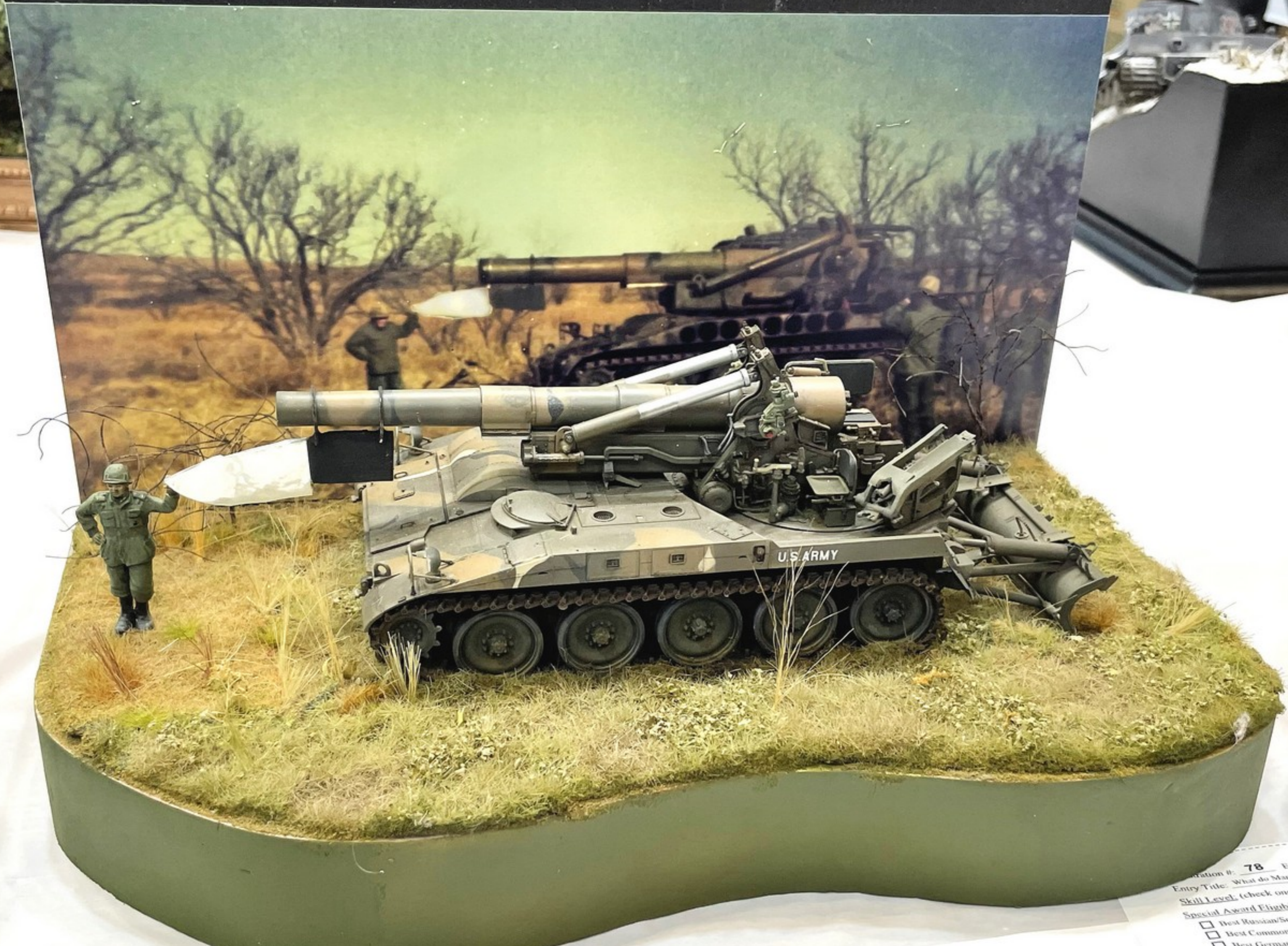
Table Car Registration #: 78 Entry Letter: A Category: 1 Entry Title: What do Marines need Artillery for? Skill Level: (check one) Junior B Special Award Eligibility (Check all that apply - you Best Russian/Soviet Best U.S. Best Commonwealth Best S Best German Best