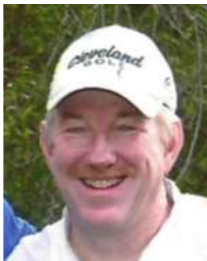
Mark Rief Communications

Note: If a player plays nearly all holes accompanied but just a few alone, the holes played alone are calculated using “par plus,” keeping in mind the maximum that can be played alone in a round eligible for posting is two holes for a nine-hole score and five holes for an 18-hole score. Some examples would be starting out alone and joining up with a player(s), or starting out accompanied and finishing the round alone.