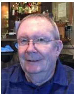
Fred Wallace Handicap

Please visit USGA.org for more information on the USGA Handicap System.