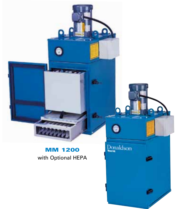
MM 1200 with Optional HEPA