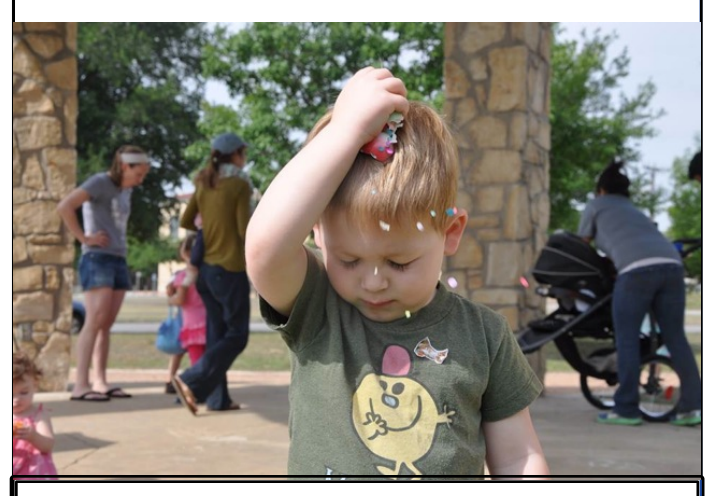
BEAUTIFUL Monticello Park children had some great Easter fun at the Egg hunt.

*Monticello Park Parents Page is a neighborhood Facebook page designed to help moms and dads in the area connect, set up playdates, talk about local events, and even post items to buy/sell/trade.