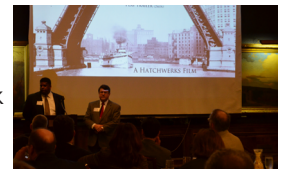
Screening at the Union League Club