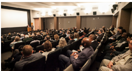
Front Row Cinema screening.

It has been an amazing year since the first screening of the fine cut of Chicago Drawbridges at the Front Row Cinema in May 2012! Twelve months later the world premier television broadcast was seen by thousands on Chicago Public Television in May 2013. In between, there were countless hours of additional shooting, editing, research, and coordinating. Yet ultimately the topic and film has informed, thrilled, and