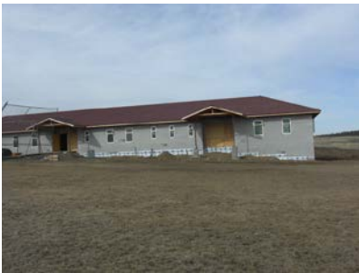
Spokane Hutterite School