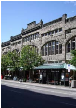
Union Block Building