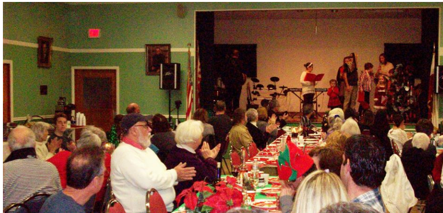
The full capacity audience enjoys the musical talents of St. Casimir's children performed on stage.