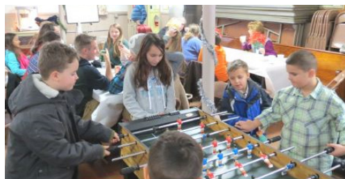
Youth enjoyed playing table games