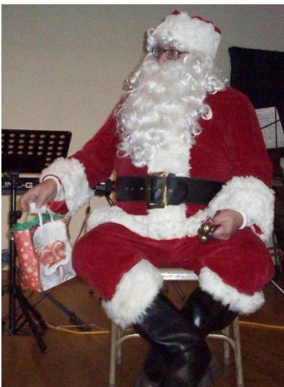
The big man brought gifts for all the children