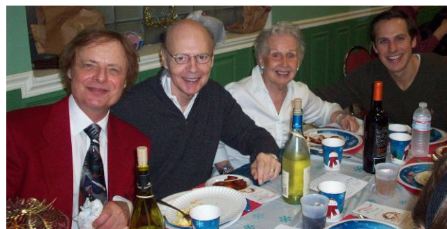
Zioto family, all smiles, enjoying the festivities