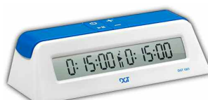
Clocks make for fairer games!

The Chess Faceoff rating report is expected to be posted this week by Chess'n Math Association. A link or report itself will be on the RC website.