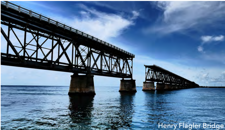
Henry Flagler Bridge