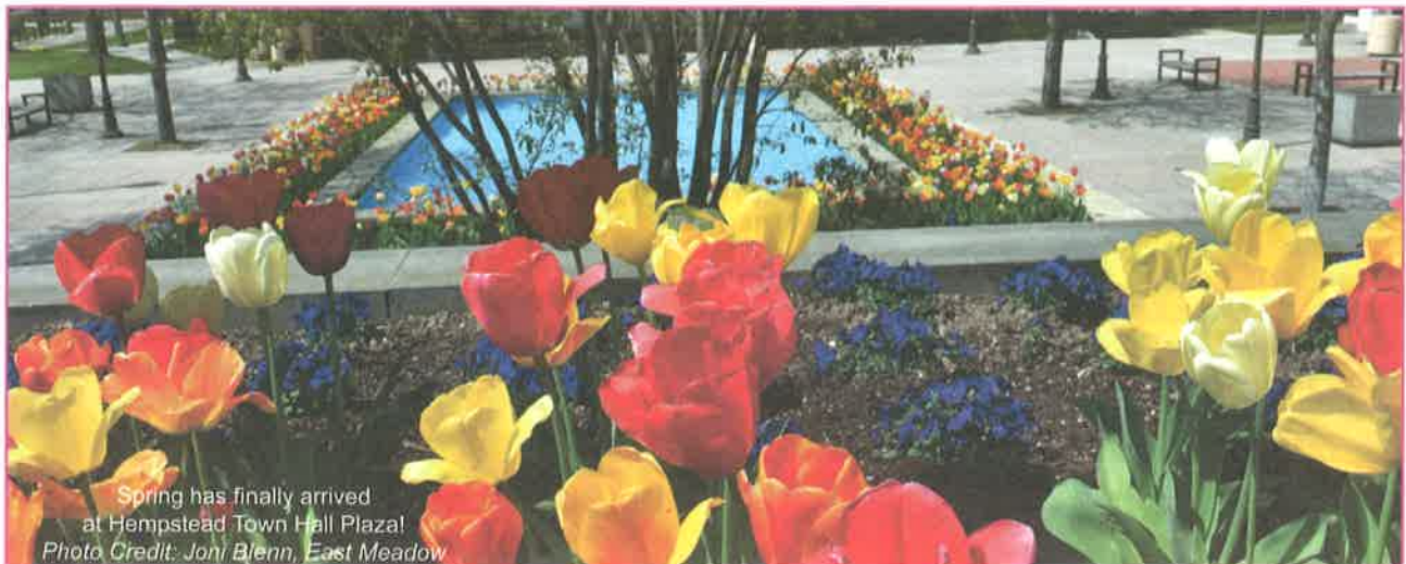
Spring has finally arrived at Hempstead Town Hall Plaza!