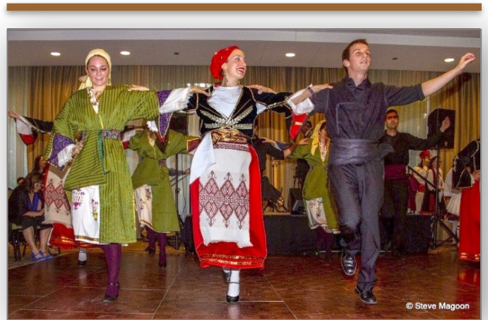
The Olympian Dancers brought the audience to their feet with enthusiastic dances during the AHEPA District 16 Convention, June 24th.

As my chairman said -- "Lets get to work."