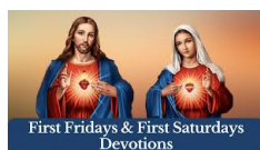
First Fridays & First Saturdays Devotions

Magnificat Days summer youth camp will be July 25-27 for children and youth ages 6-18. We will need volunteers to help with morning sign in's, activities, and meal prep. Can you help? Call Kathleen Kasperson: 707.513.5672. Registration and more information available soon.