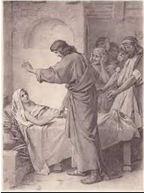
By: The Word Among Us

JUNE 29 & 30, 2024 13 TH SUNDAY IN ORDINARY TIME