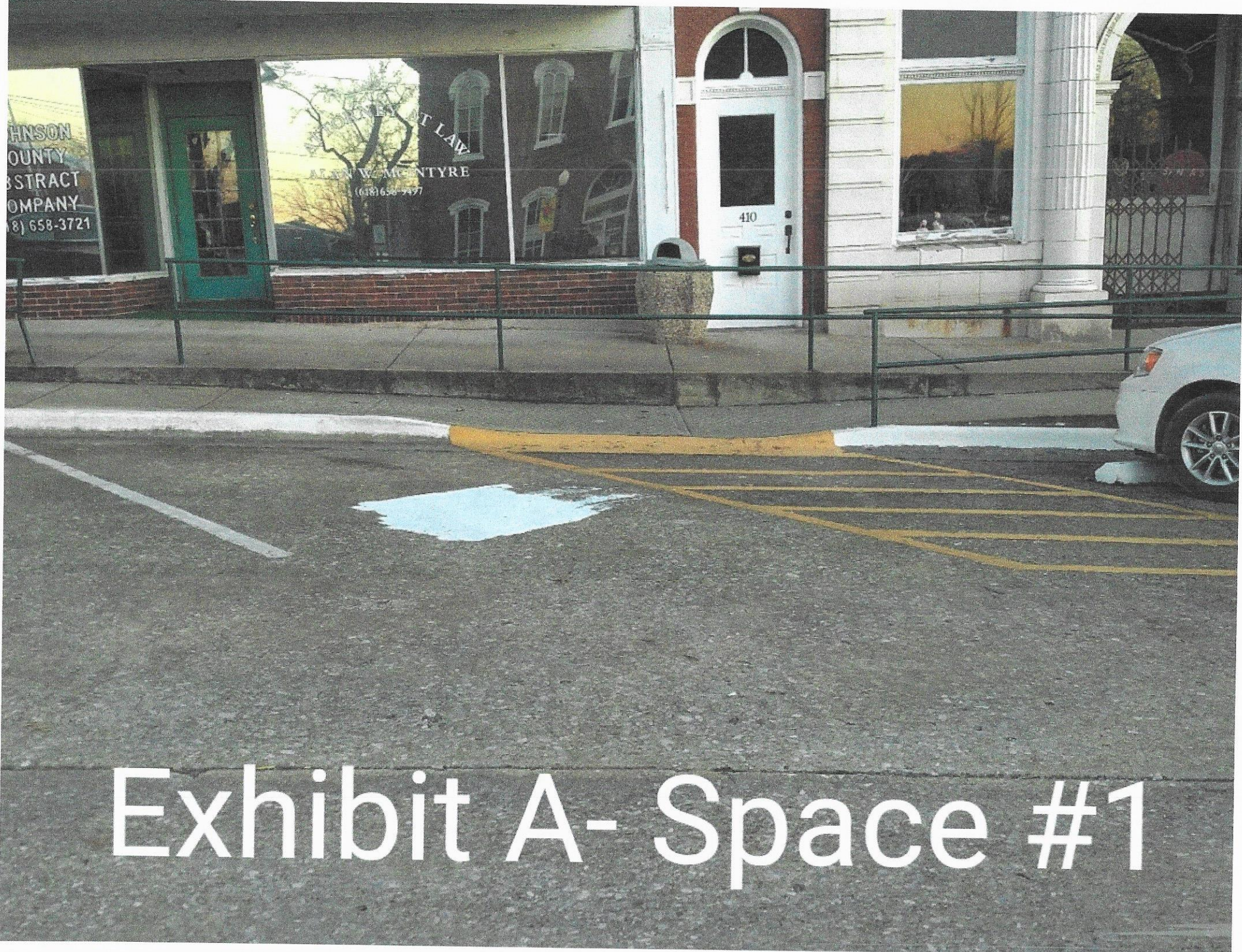
Exhibit A- Space #1