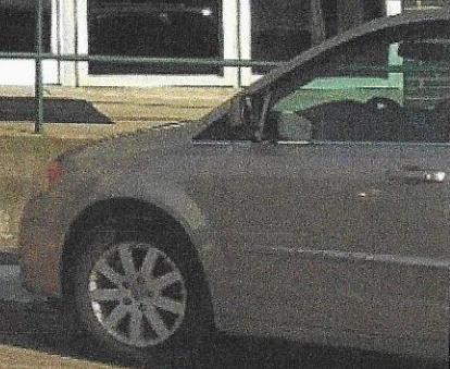
Exhibit B- Space #2