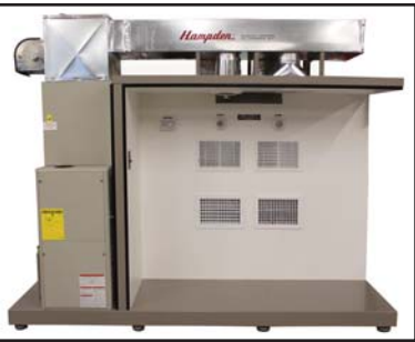
H-FAHT-1-G-A Forced Air Heating Trainer with Summer Air