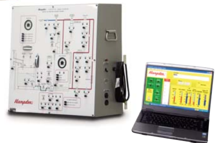
Model H-DOHS-CSI ▶