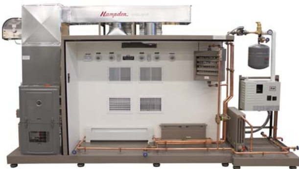
Model H-AHST-D3 Air/Hydronic: Gas/Electric with Summer Air