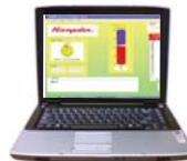
◀ Model H-DHPS-CSI