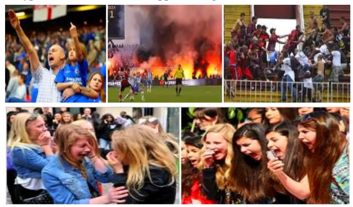
expensive security. Big crowd entertainment ends!

Crowd entertainment creates big crowds. A big crowd is volatile, fights often break out, hysteria is possible, stampede... A big crowd is a threat to themselves and the commuity. Big crowds are a magnet to all types of addicts and their suppliers. Big crowds need a lot of