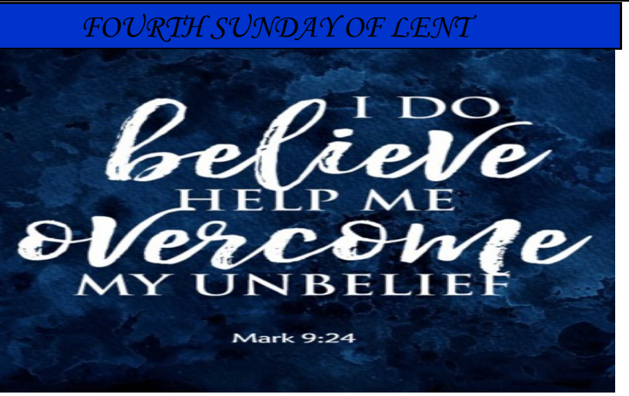
THEME: FAITH AND UNBELIEF

We are often asked to take a stand, be it concerning politics, the education of the children, or the way work should be done. Taking a stand, especially one concerning a controversial issue, may involve opposition. Christians are asked to take a stand quite often.