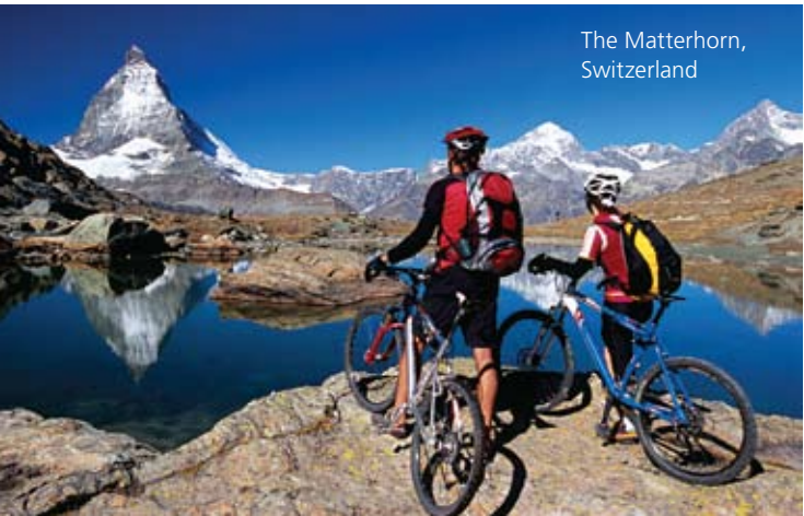
The Matterhorn, Switzerland

48% of you want to read more about travel to Europe