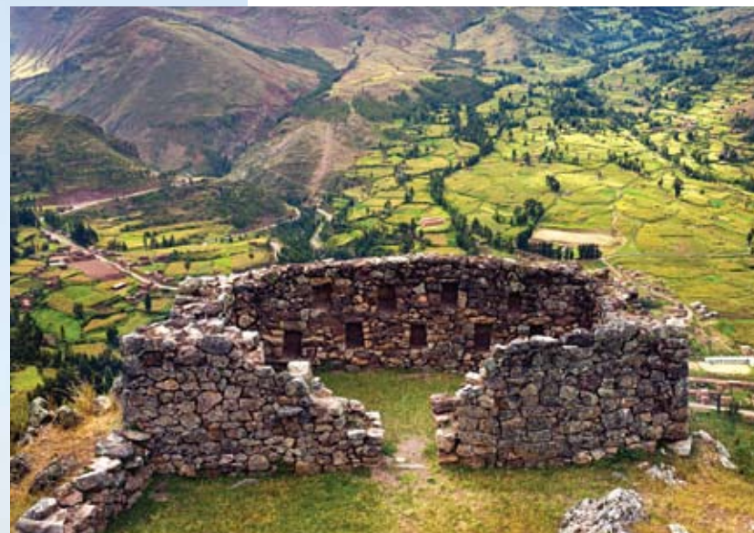
Masai warriors in Kenya (left); Sacred Valley of the Incas in Peru (above)

of our readers reported that they enjoy cultural or historical activities when they travel