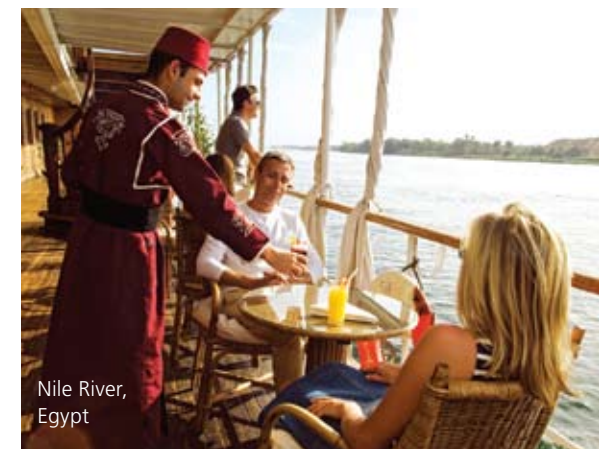
Nile River, Egypt

Get an intimate view of Egypt on a small-group land and cruise vacation. See Cairo and its surrounding sights during an in-depth tour with an expert Egyptologist. You'll stay in a luxurious hotel and in an outside suite aboard a 5-star Nile cruise ship. Onboard, enjoy delicious meals served in an elegant atmosphere.