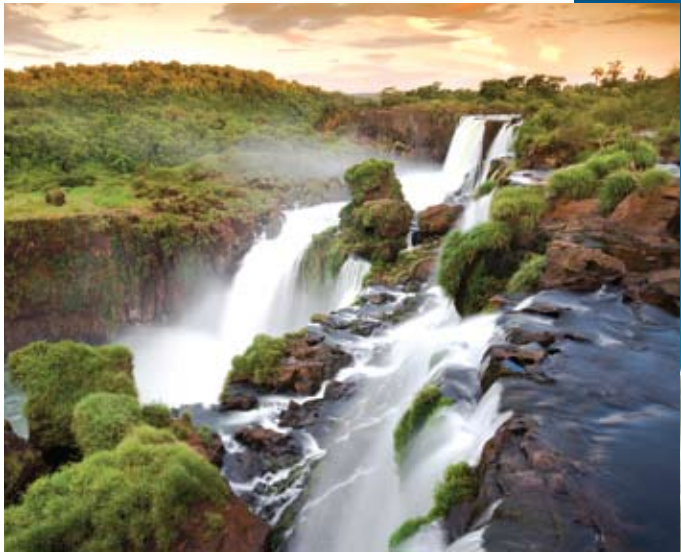
Iguassu Falls on the Brazil/Argentina border (above); England's Tower of London (right)