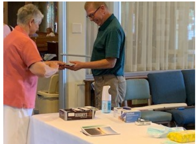
Fathers Day candy bars are given out by the Activities & Fellowship Boards