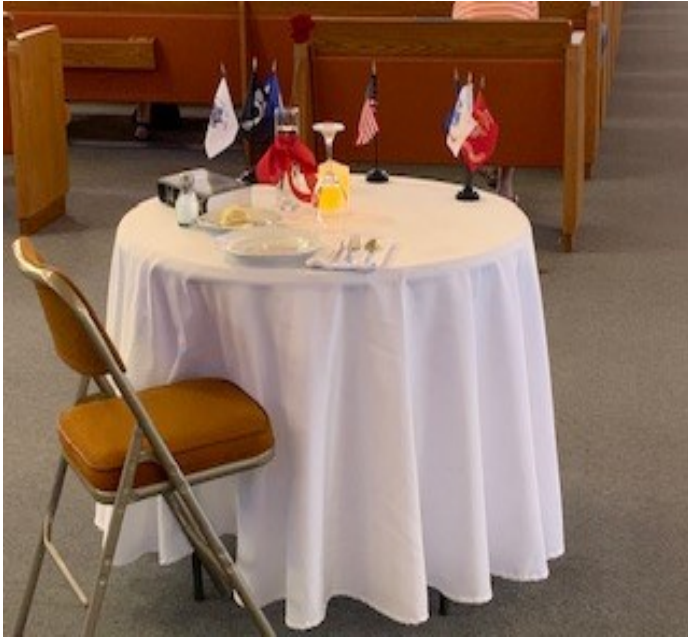
Missing man table