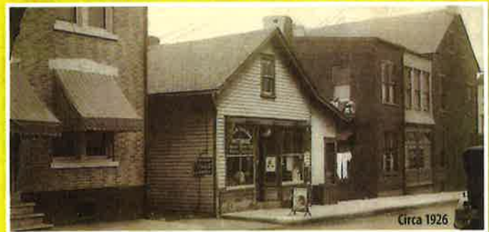
Original Store, Founded 1922 711 Liberty St., Allentown, PA