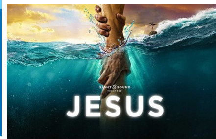
Jesus Show Sight and sound