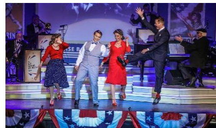
All Hands on Deck

For More Information call the Senior Center 740-385-6581