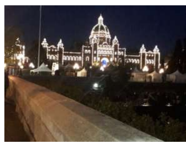
Doe Run 2017 Victoria, BC