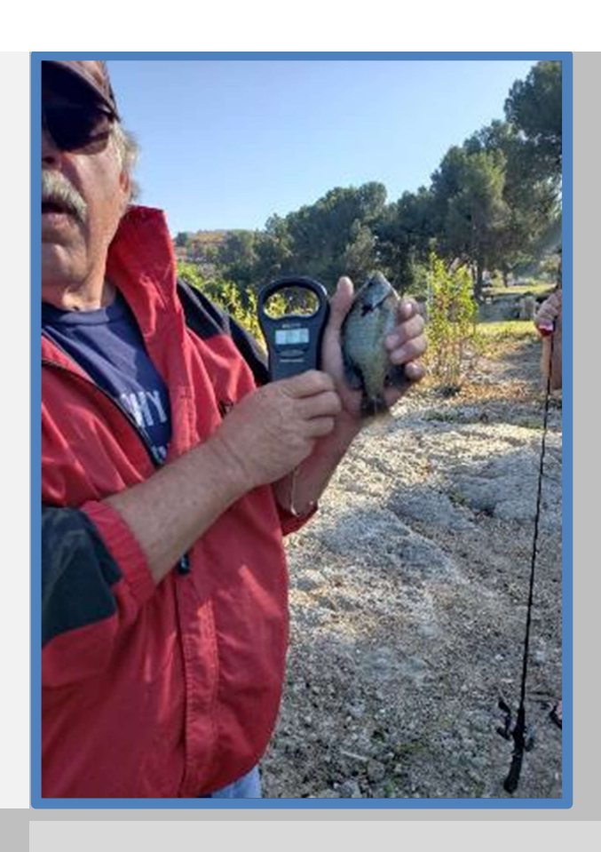
© 2006 Turner's Rod and Reel Club

This email was sent by Turner's Rod and Reel Club, Covina CA 91722