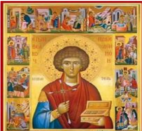
Gr. Martyr and Healer St.

PLEASE PRAY FOR HEALING, COMFORT, AND SPIRITUAL PEACE